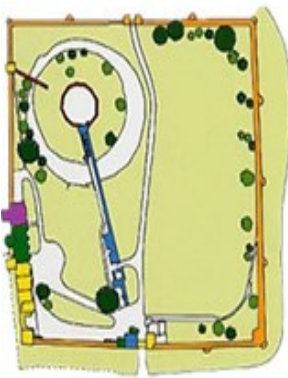
CARDIFF CASTLE - 2000 YEARS OF DEVELOPMENT

Cardiff Castle is one of Wales's biggest attractions. Mainly, because of its age. It has been standing for at least 2000 years. This Diagram shows what happened to the castle in 2000 years it has been around .